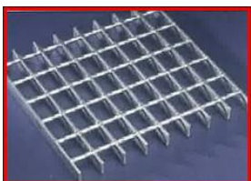
SG *** / 40 / 50 *** 40mm Load Bar Pitch 50mm Twist Bar Pitch