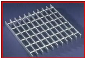
SG *** / 30 / 50 *** 30mm Load Bar Pitch 50mm Twist Bar Pitch