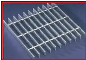
SG *** / 30 / 100 *** 30mm Load Bar Pitch 100mm Twist Bar Pitch