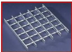
SG *** / 60 / 50 *** 60mm Load Bar Pitch 50mm Twist Bar Pitch