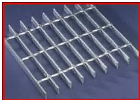
SG *** / 40 / 100 *** 40mm Load Bar Pitch 100mm Twist Bar Pitch